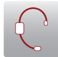
Call Centre/ MOTO