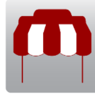
Marketplaces & Affiliates