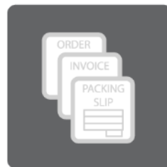
Commerce & Orders