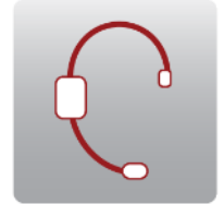
Call Centre/ MOTO