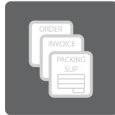
Commerce & Orders