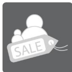
Marketing & Merchandising