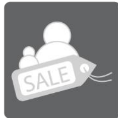
Marketing & Merchandising