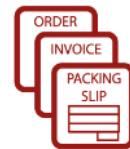
Order Management System